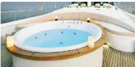
Jacuzzi on the deck of a luxury yacht.