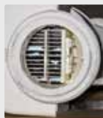
Swimming pool filter