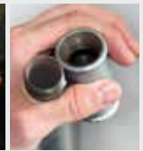
Swimming pool filter