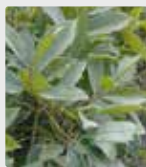
Plants and turf