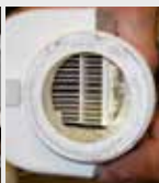
Swimming pool filter