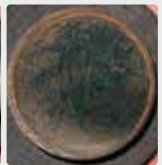
Biofilm in a piping system