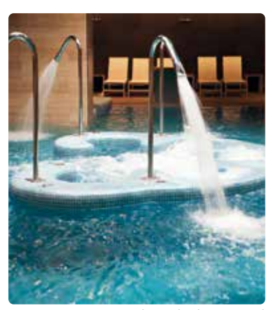
Thermal saltwater pool

Pools are half-open loop systems which suffer constant water loss as the pool water evaporates. The water demands constant maintenance and chemicals need to be added to keep bacteria, algae, and air quality in compliance with standards. Vulcan improves the water quality and with this the effectiveness of certain substances. Vulcan reduces the cleaning effort for the pool itself, the water line, for tiles, grids, floors and walls.