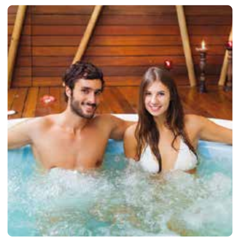
Hotel whirlpool in a wellness area