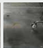
Grill plate in a restaurant