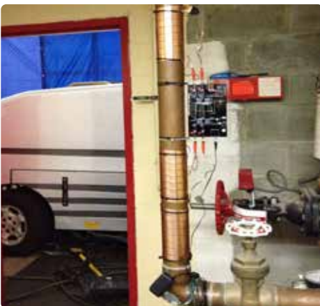
Vulcan S25 installed at Ice Land in New Jersey, USA.