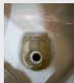
Sanitary toilet bowl