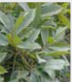
Plants and turf