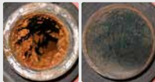
Biofilm in a piping system